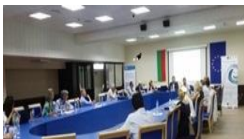
Opening of the Conference

Clusters’ representatives esteem that similar approach to identify common innovation needs could be applied to other sectors to boost competitiveness of SMEs.